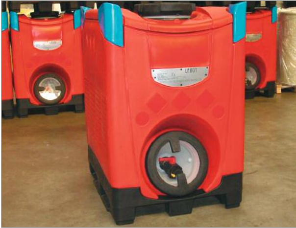
Safe and durable. The new iCon®

The iCon® has been fully approved for multi-trip transportation of dangerous products, and has a capacity of 1000 litres. The iCon® has not only achieved the highest possible UN approval but has also undergone a series of intensive field tests. The unit has been designed to have an active life of 10 years meeting the current 5 year legal limit on the liner.