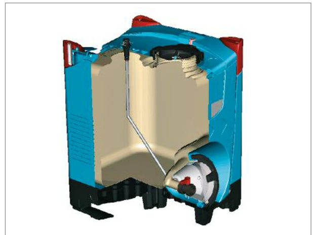
Integrated spill containments also in outlet area.

The iCon® is unique because of its separate spill containments around the bottle and outlet area. The fully banded approach prevents hazardous liquids from escaping into the environment in the event of an incident. The transparent surround in the valve area makes it possible to detect any leakage prior to opening the valve.